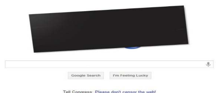
FIGURE 1: GOOGLE'S HOMEPAGE DURING THE SOPA AND PIPA PROTEST<sup>42</sup>

Tell Congress: Please don't censor the web!